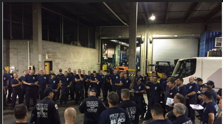
New York's Urban Search & Rescue New York Task Force One (pictured) has been deployed to Houston to assist the city in its Hurricane Harvey relief efforts.