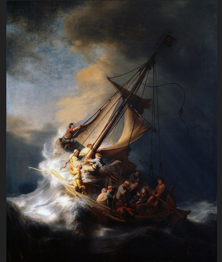
The Storm on the Sea of Galilee by Rembrandt, 1632.

24 And behold, there arose a great storm on the sea, so that the boat was being swamped by the waves; but he was asleep. 25 And they went and woke him, saying, "Save us, Lord; we are perishing." 26 And he said to them, "Why are you afraid, O you of little faith?" Then he rose and rebuked the winds and the sea, and there was a great calm. 27 And the men marveled, saying, "What sort of man is this, that even winds and sea obey him?" (Mat 8:24-27 ESV)