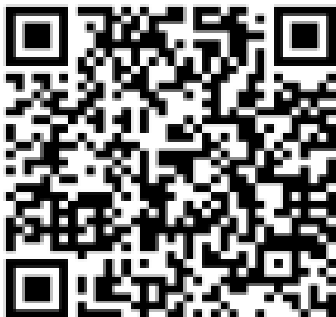
Spiritual Gift Form