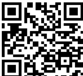
Dallas Mission Trip