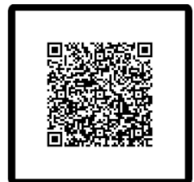
▶ VBC Registration

Note : Please scan the applicable QR code above, based on your specific need.