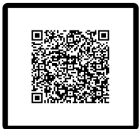
▶ CBC Visitor Form

We welcome our visitors to consider joining the CBC family as members. A one-hour class with one of the Pastoral staff will be conducted to hear your testimony, and to present CBC beliefs, missions and ministries. If you have not been baptized by immersion yet, we also invite you to follow in the believer's baptism and join our church family.