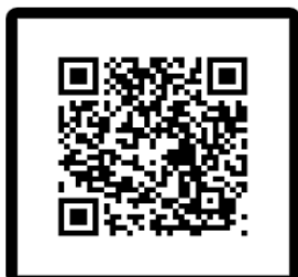
▶ Membership Form