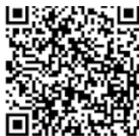
Senior Banquet Code