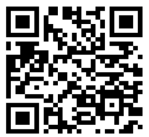
Dallas Mission Trip