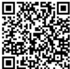
Spiritual Gift Form